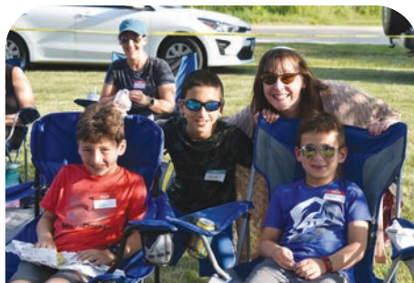
Shabbat Under the Stars