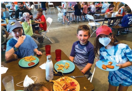
Temple Chai at OSRU!