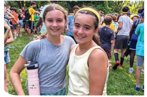
Temple Chai at OSRU!