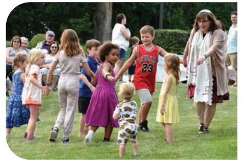
Shabbat Under the Stars