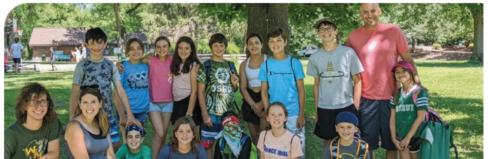
Temple Chai at OSRU!