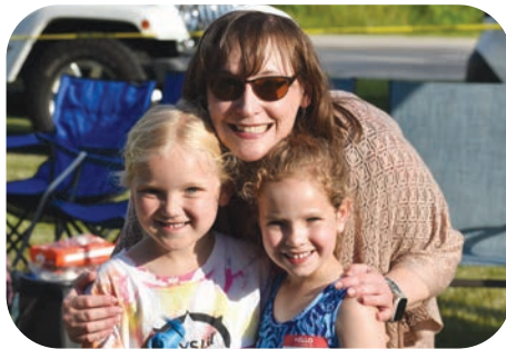
Shabbat Under the Stars