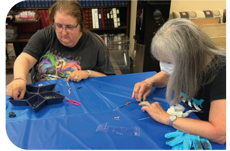
WTC Jewelry Make 'n Take