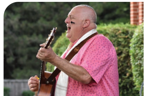
Shabbat Under the Stars