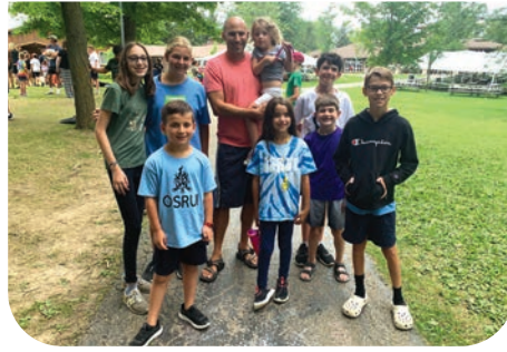
Temple Chai at OSRU!