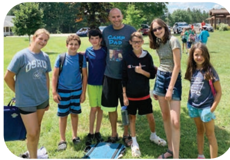
Temple Chai at OSRU!