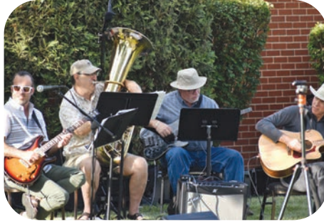
Shabbat Under the Stars