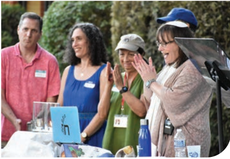
Shabbat Under the Stars