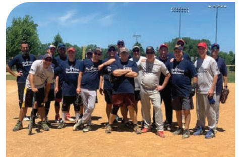
Chai Guys Softball Team