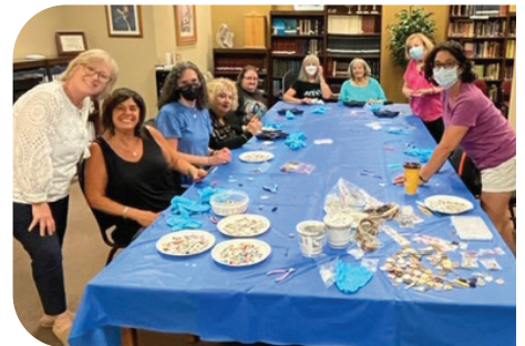
WTC Jewelry Make 'n Take