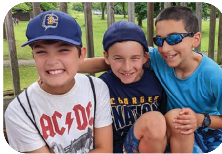
Temple Chai at OSRU!