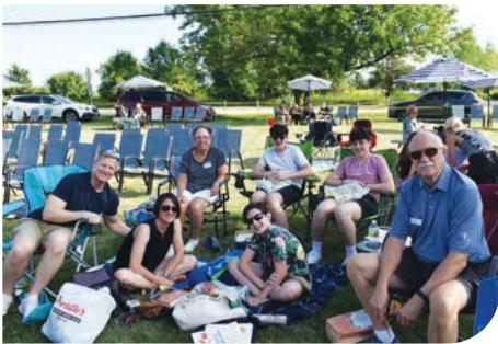
Shabbat Under the Stars