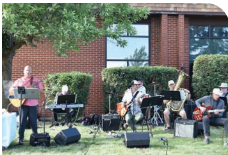
Shabbat Under the Stars