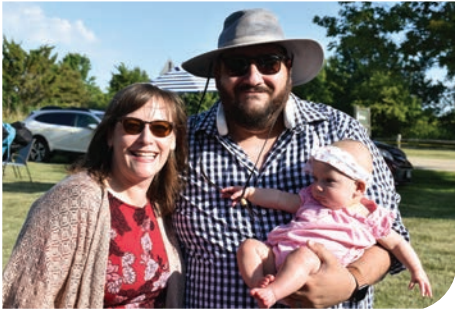
Shabbat Under the Stars