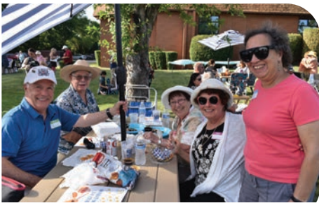
Shabbat Under the Stars