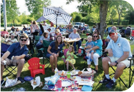
Shabbat Under the Stars