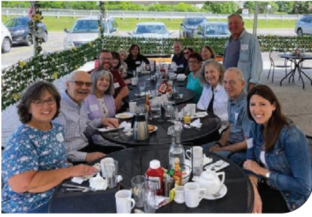
Northbrook Brunch Club