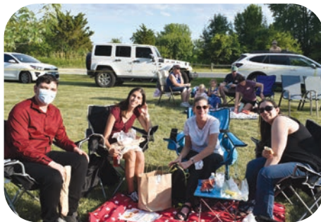
Shabbat Under the Stars