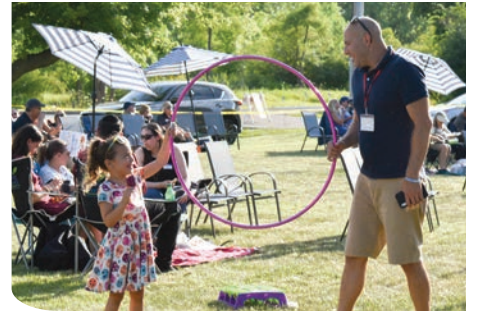
Shabbat Under the Stars