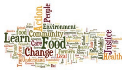
Priorities for this Legislative Agenda through a Jewish Lens