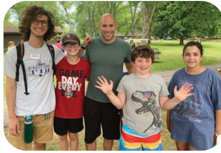
Temple Chai at OSRU!