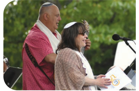
Shabbat Under the Stars