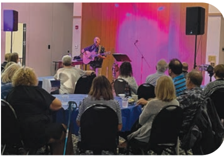
Cantor's Coffee House