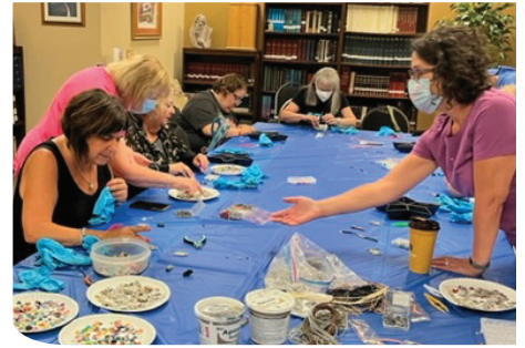
WTC Jewelry Make 'n Take