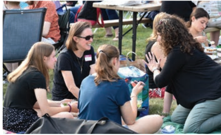
Shabbat Under the Stars