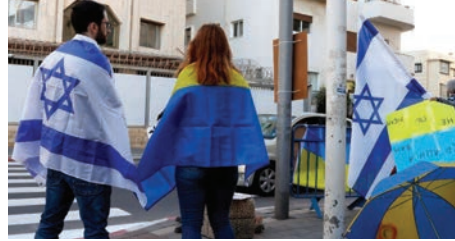
The Jewish Community of Ukraine