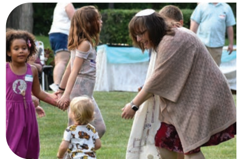
Shabbat Under the Stars