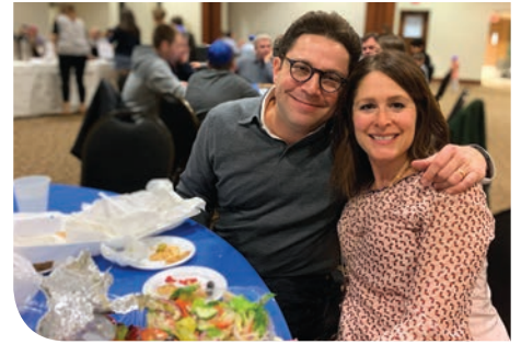
Congregational Shabbat Dinner