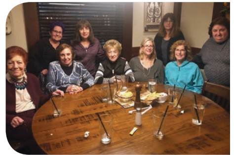
Women of Temple Chai at Biaggi