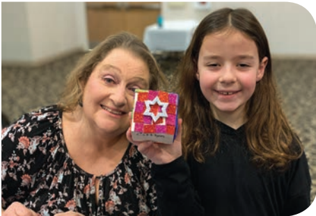
Chalutzim Chanukkah Program