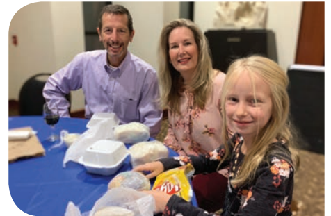
Congregational Shabbat Dinner