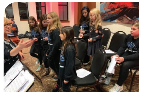
Ruach Youth Choir