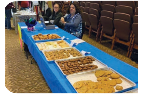
Women of Temple Chai Cookie Walk