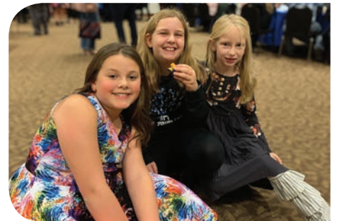
Congregational Shabbat Dinner