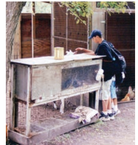
Scott Goode as a camper in 1999