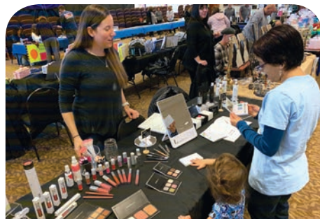
Women of Temple Chai Bazaar