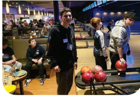
Temple Chai at NFTY678