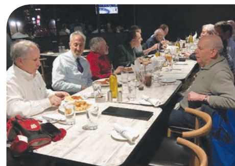
Photo from Chai Guys Night Out in December at Wild Buffalo

We look forward to seeing you at these upcoming programs!