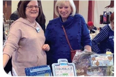
Women of Temple Chai Bazaar