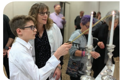
Congregational Shabbat Dinner