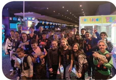
ChAmPY and Jr. ChAmPY at Laser Tag