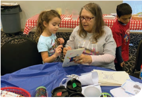
Chalutzim Chanukkah Program