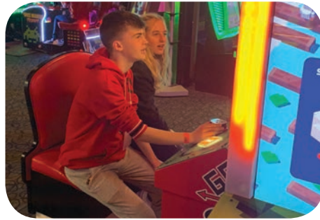
Temple Chai at NFTY678