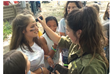
A Temple Chai camper during Yom Yisrael (Israel Day)