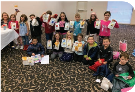
Chalutzim Chanukkah Program