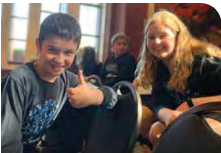
High Holy Days