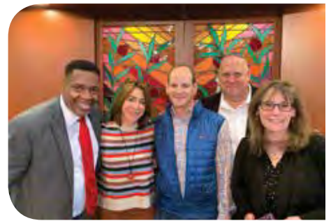
Soul Children Concert