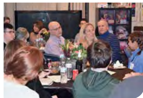
Pictures from the pre-trip Dinner and Havdallah