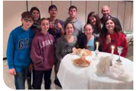
7th and 8th Grade Retreat