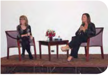
Women of Temple Chai Dinner