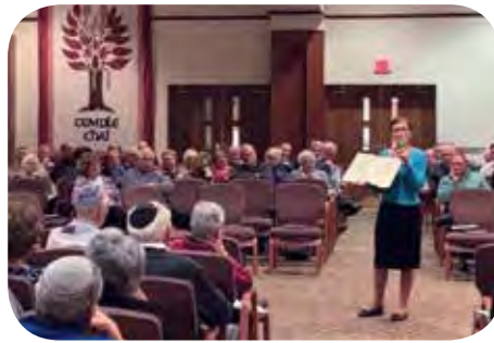
Scholar In Residence