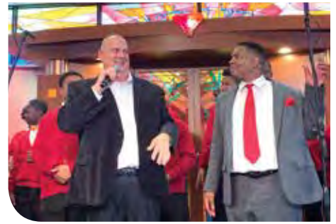
Soul Children Concert