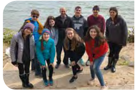
7th and 8th Grade Retreat