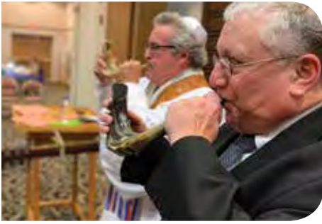
High Holy Days