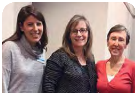
Scholar In Residence