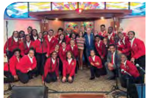
Soul Children Concert