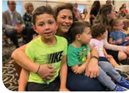
High Holy Days