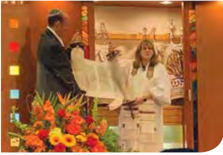
High Holy Days