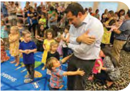
High Holy Days