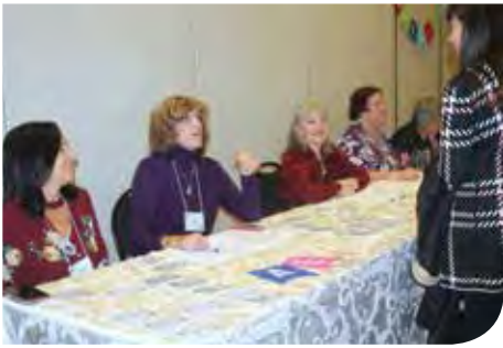
Women of Temple Chai Dinner