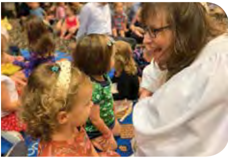
High Holy Days