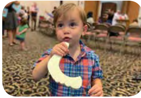
High Holy Days