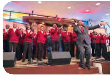
Soul Children Concert