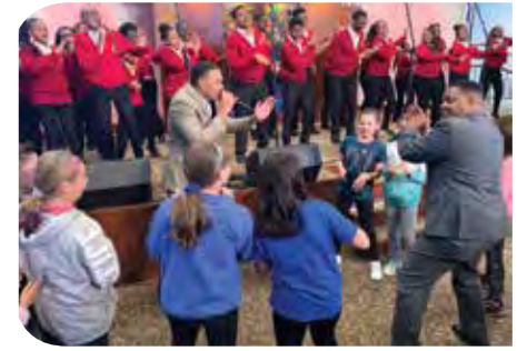
Soul Children Concert