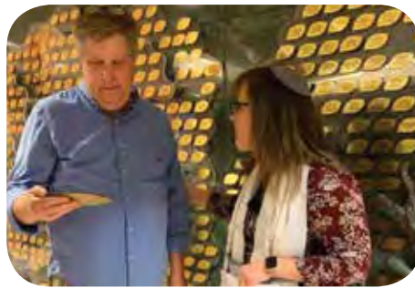
Scholar In Residence